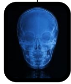
Alumni Director TBD