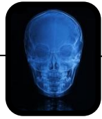
Interventional Radiology Program Director TBD