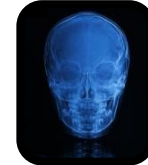
Pediatric Imaging TBD