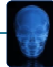
Pediatric Imaging TBD